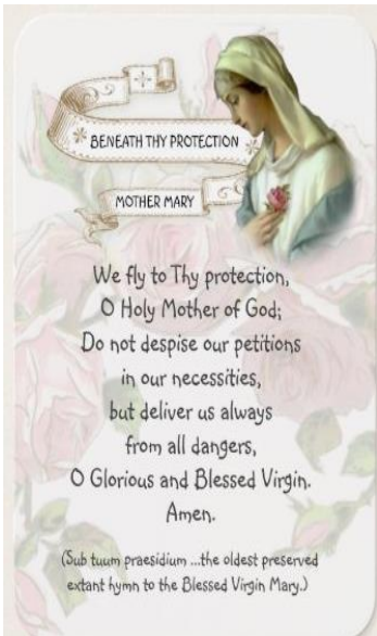
The oldest preserved extant hymn to the Blessed Virgin Mary as Mother of God. The original Coptic Greek document is from the 3 rd century.

As this is my last article as Grand Knight for the Crier, let me say serving you this year has been an extreme honor. Having the opportunity to listen to you, work with you, and be your Grand Knight has been invigorating.