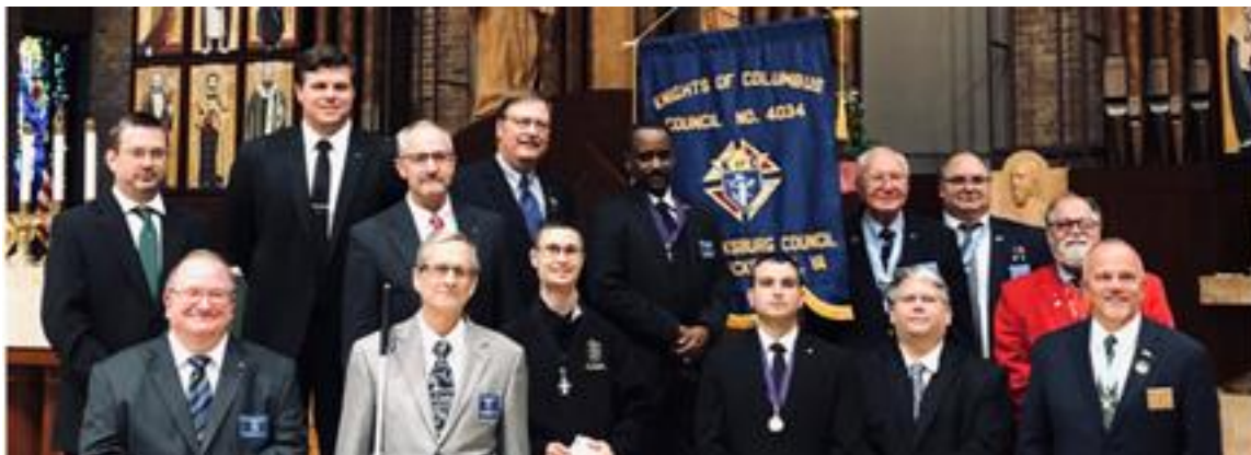
Last Year's Council Officers, Unmasked Council Officers